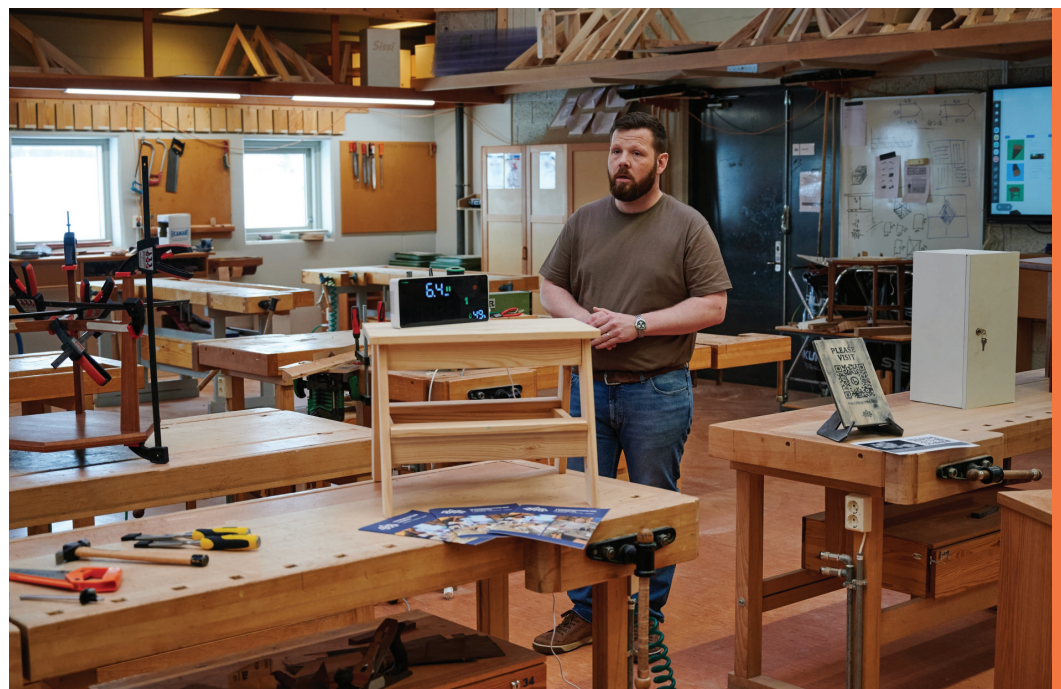
Visiting Akureyri Comprehensive College, April, 2024