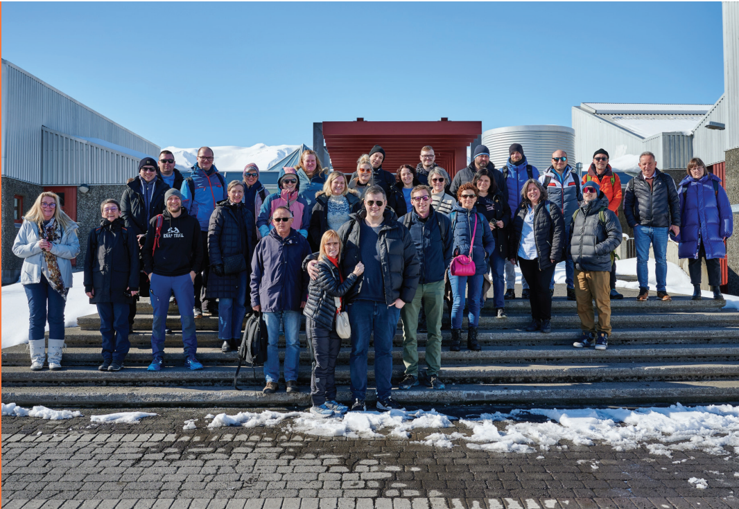
Study visit, Iceland, April, 2024