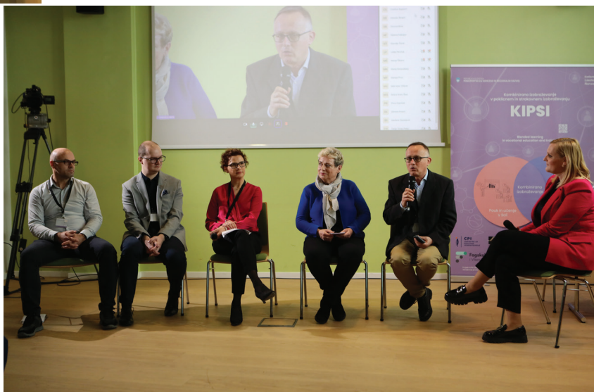
Innovative, Combined, Successful! Conference, Ljubljana, March, 2024