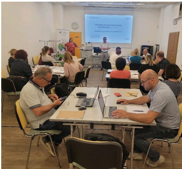
Training of the development teams of Slovenian partners, Ljubljana, 25th of May, 2022

Introduction of blended learning at the school level as a comprehensive organization demands a strategic approach and inclusion of blended learning in wider school's development. Through strategic leadership, we involve all those who will introduce change and those who will be affected by them. A need analysis was supported by self-evaluation for three target groups – school's leadership and development team, teachers and students.