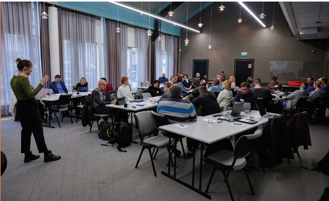
Study visit in Norway, 4th–8th of April, 2022

Between 4th and 8th of April 2022 we organised a study visit and partner meeting in Norway. We visited partner schools Fagskolen i Viken and Åssiden videregående skole. At upper-secondary VET school in Åssiden we visited students and teachers in school workshops, where they introduced us, how they managed the epidemic with the use of blended learning approaches. At higher VET school (Fagskolen i Viken) epidemic also contributed to the development of distance education, although it was not a completely new approach for them. High school students in Norway are mostly employed adults, who fulfil school obligations in the evenings and on weekends and mostly at a distance. They presented examples of blended learning in the industry 4.0 laboratory, and as instructions of mathematics and vocational subject for nurses. Representatives of school management, local stakeholders and the Østfold University contributed with the presentations of approaches to the strategic development in the field of blended learning in Norway.